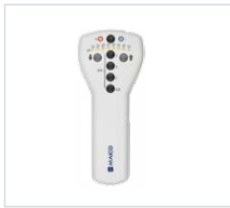
MA 1 handheld device