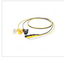
Electrode lead wires