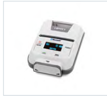
Printer HM-E 200