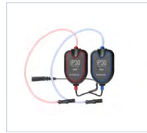
Insert earphones IP30