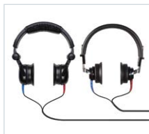
AC headphones DD45