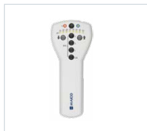
MA 1 handheld device