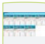
TREMETRICS HearCon Software