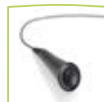
Patient response switch