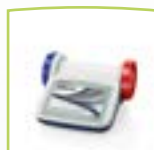
TREMETRICS RA660 audiometer